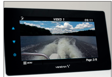
Every place of the boat is under your control thanks to the dual video input