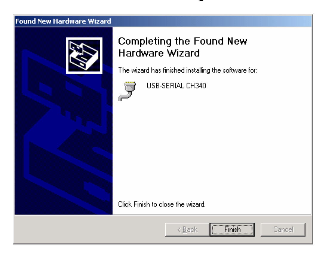
Step 7: The USB to Serial Converter cable has been successfully installed on your computer!

Step 6: [Win XP and Vista] The following dialog window will pop up after the USB to Serial Converter cable is successfully installed. Click the 'Finish' button to close the dialog window.